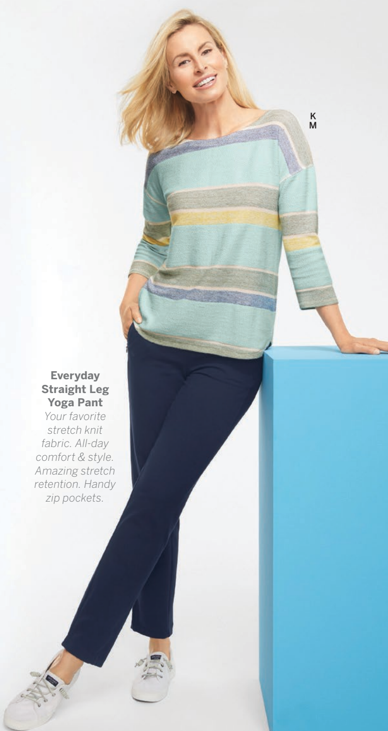
Everyday Straight Leg Yoga Pant Your favorite stretch knit fabric. All-day comfort & style. Amazing stretch retention. Handy zip pockets.

A. Drawstring Hem Stripe Pullover Round neckline with back cutout. Short dolman sleeves. Slightly above hip length. Polyester/cotton. Machine wash. Salt blue multi. A62024 M XS-XL P P-XL $69.50 W X-3X WP X-3X $79.50