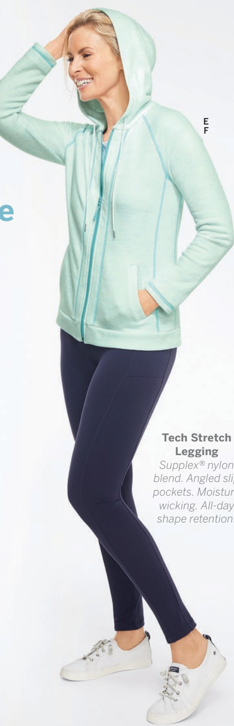
Tech Stretch Legging Supplex® nylon blend. Angled slip pockets. Moisture wicking. All-day shape retention.

Our comfortable styles fit like a dream. And modern updates like breathable fabrics add versatility.