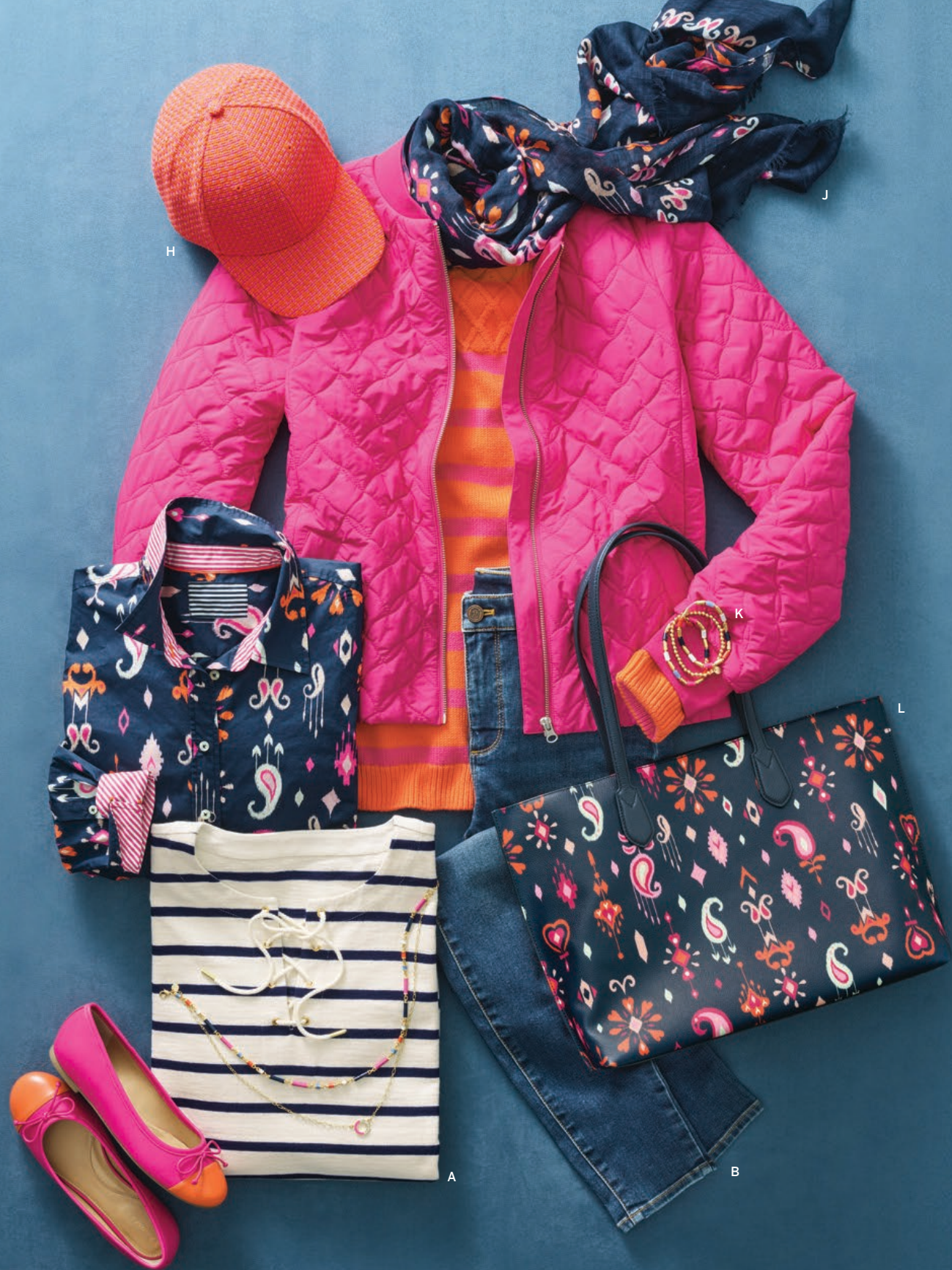
H. Tweed Baseball Cap Pink/bright tangerine. H42411 $44.50