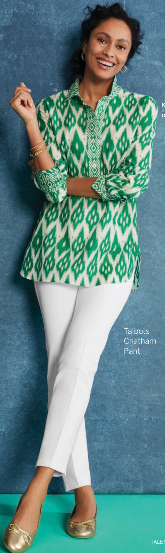
Talbots Chatham Pant

Earrings, p38; bangle, p33; bracelet, p42.