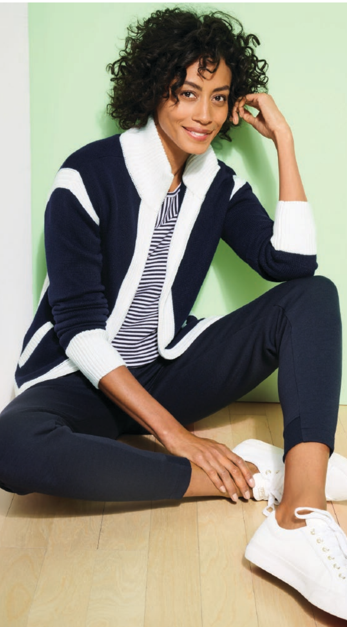
A. Quilted Crewneck Pullover White. A50319 M, P, W, P $129-$149

When you travel, you'll want to get there in effortless comfort and style. That's where the newest pieces from our modern athleisure collection T by Talbots shine. They're packable, versatile, light-yet-cozy and just what you'll want for going places (or staying close to home).