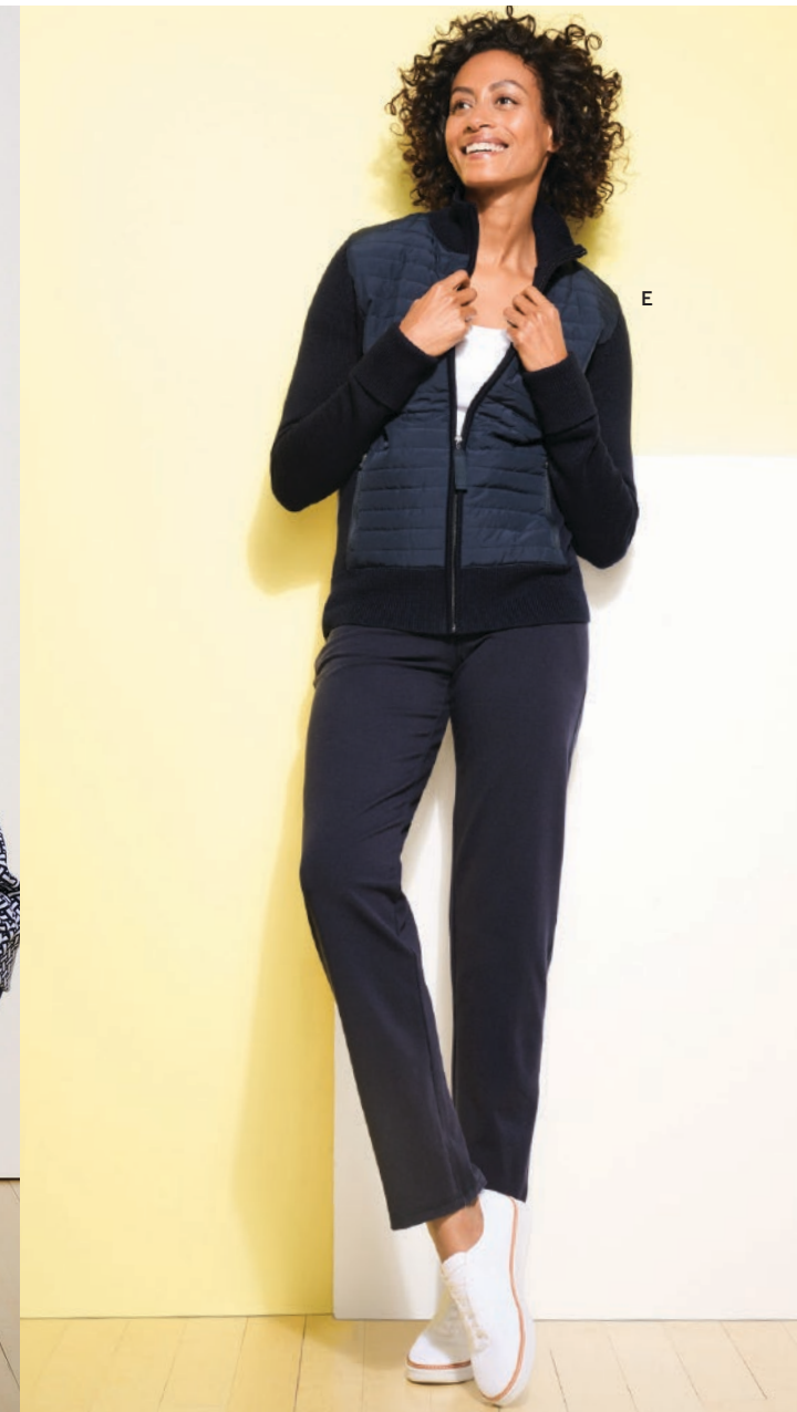
E. Everyday Stretch Straight Leg Pants Indigo. E51319 M, P, L, W, WP $89.50