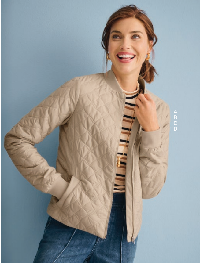
Talbots Hampshire Pant