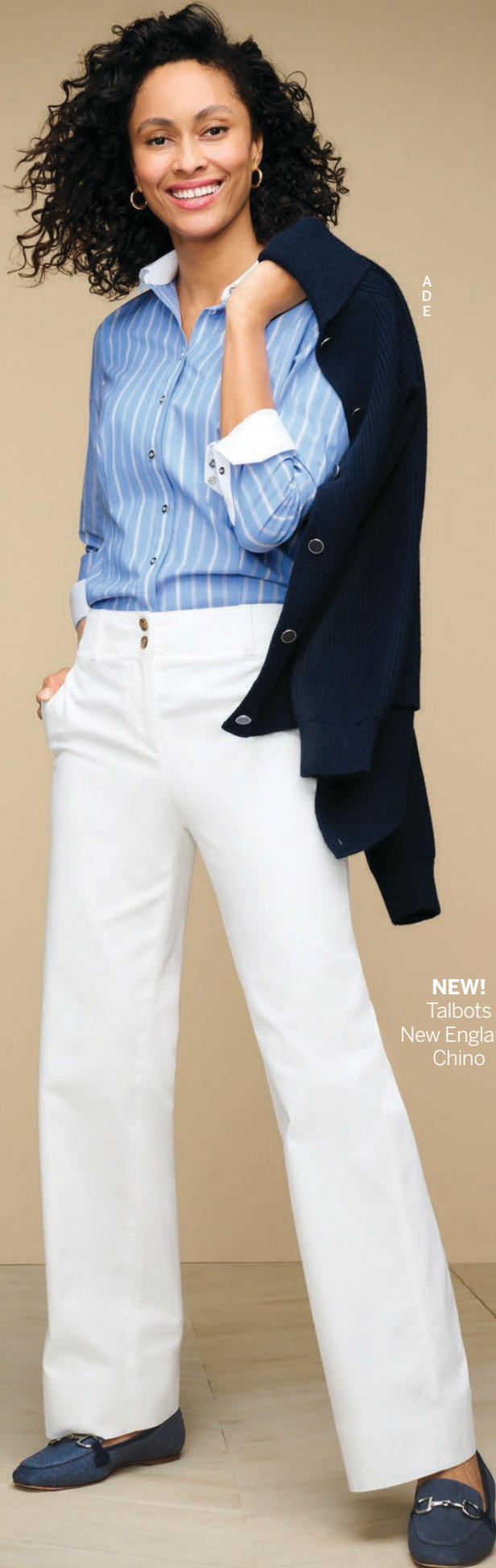
NEW! Talbots New England Chino