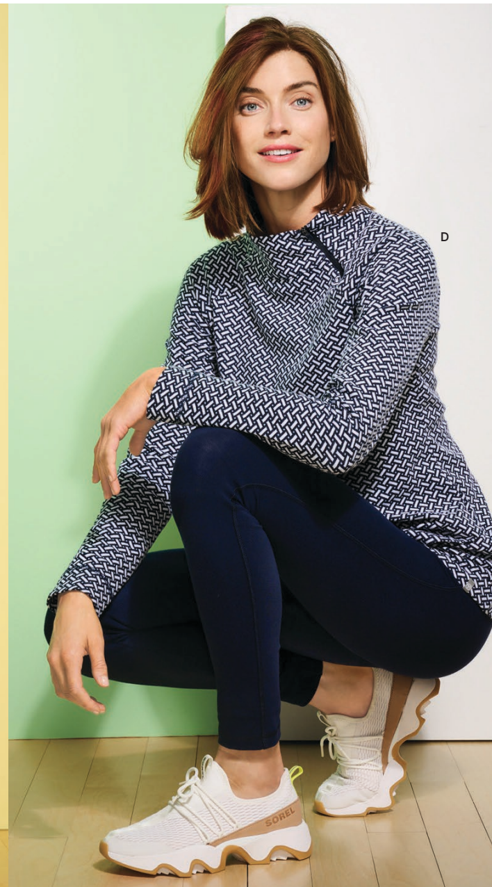
D. Rouen Geo Asymmetrical Zip Mockneck Pullover Indigo/white. D51319 M, P, W, WP $99.50-$109